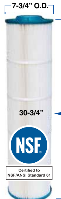
LT2 Cartridge Length and O.D.